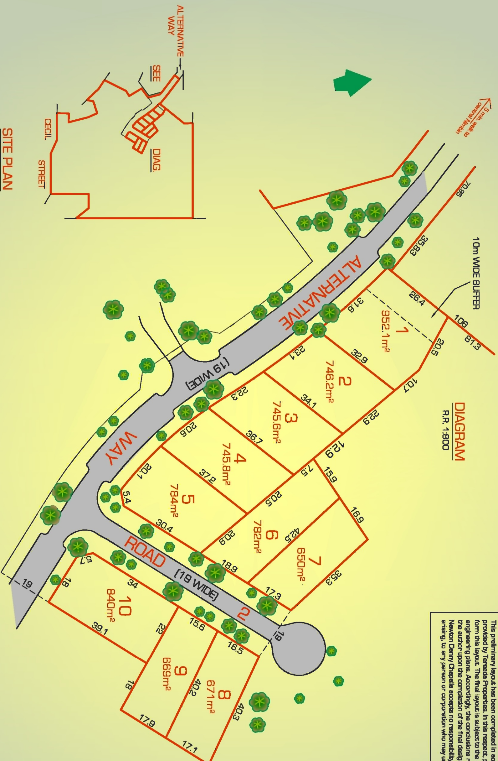
DIAGRAM R.R. 1:800